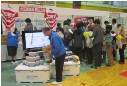
Shoo Industrial Park Open Factory held on October 26, 2019

During FY2019, the Okayama Factory set up a booth at the Shoo Industrial Park Open Factory Initiative 2019. The Omiya Factory planned to set up a booth at the Saitama City Environment Forum as it does every year, but the event was canceled due to the effects of a typhoon.