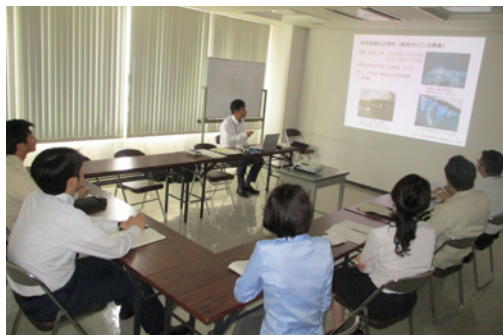
A lecture on environmental training

Training on the environment will continue going forward while striving to raise employees' awareness of the environment and legal compliance.