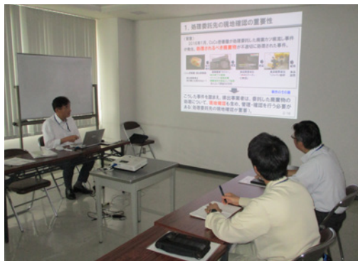
A lecture for those in charge of waste disposal